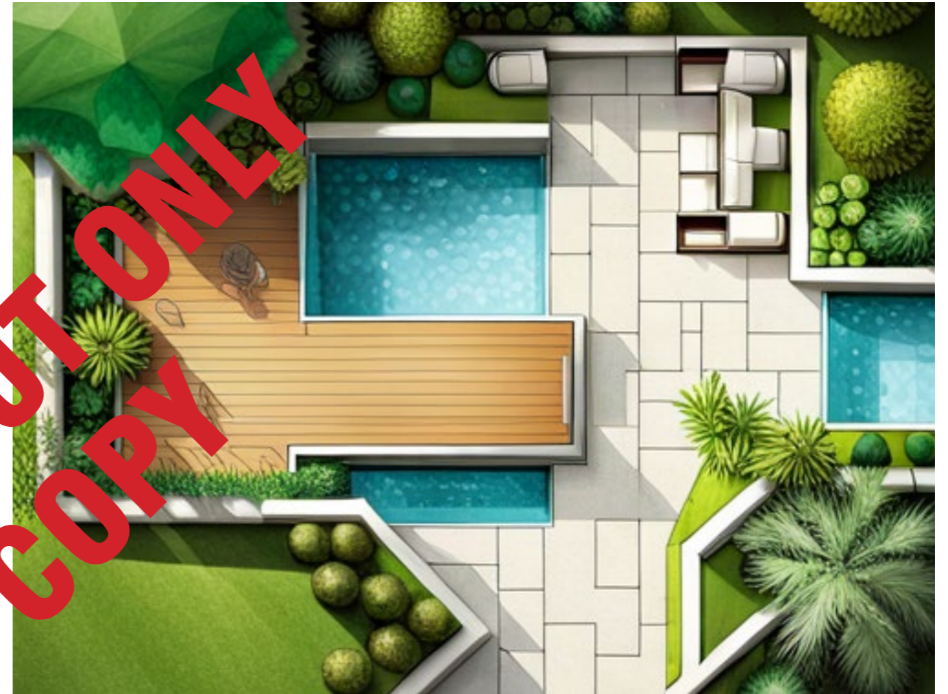
Area Plan of the deck area and water feature