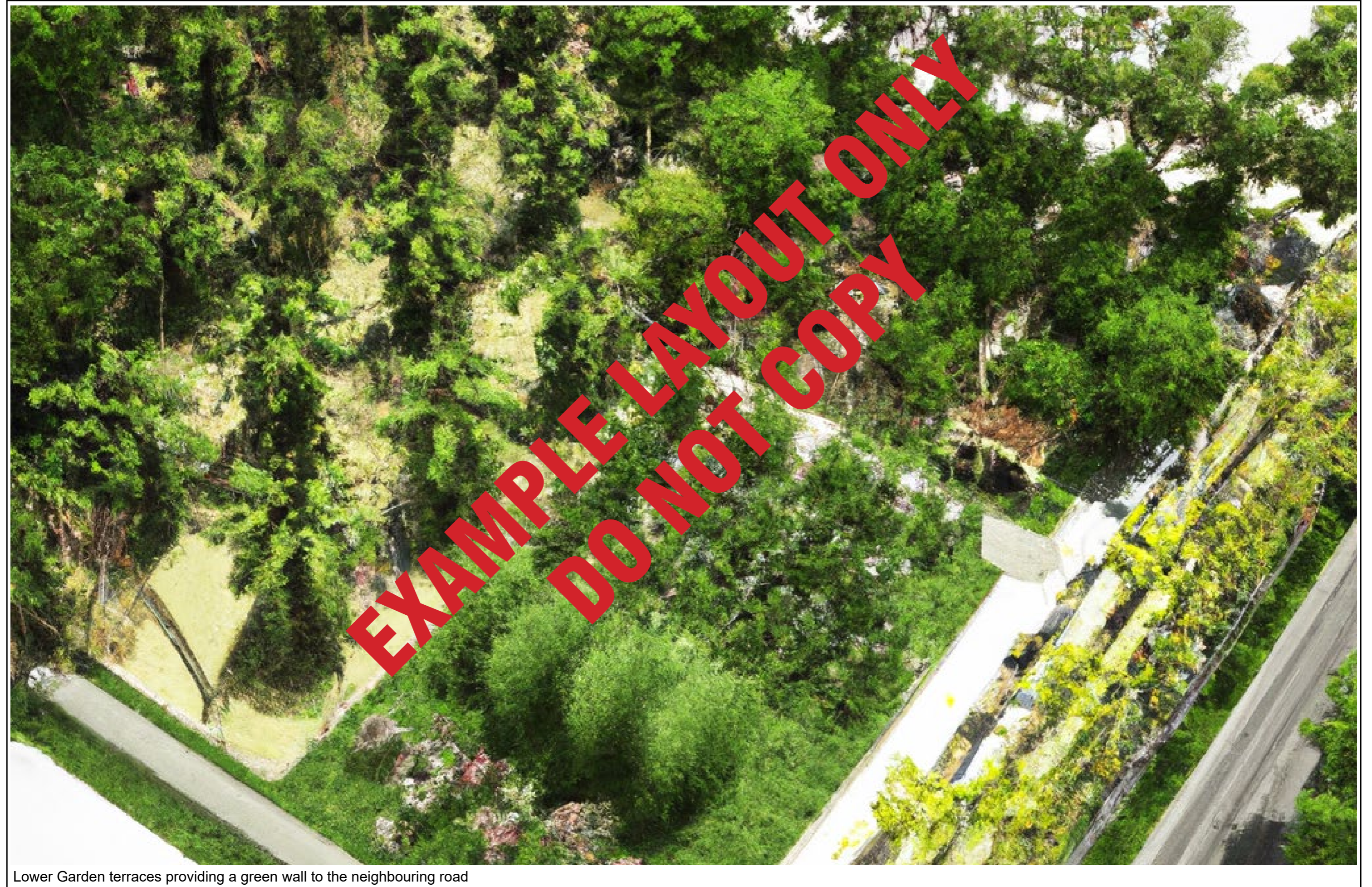
Lower Garden terraces providing a green wall to the neighbouring road