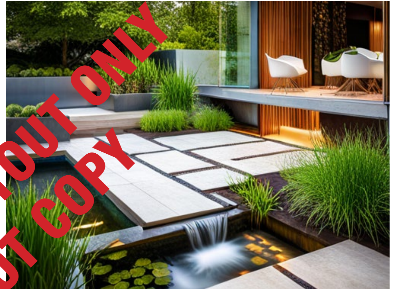
Sustainable water feature using recycled water from the roof of the residence