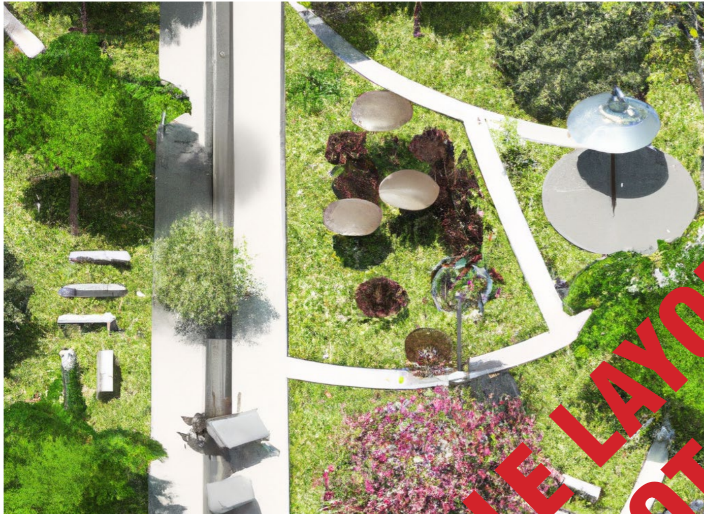
Path and walkway collage